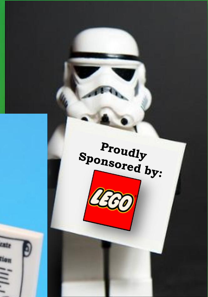
LEGO 8805 Minifig Series 5