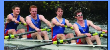
Men's Coxed Fours